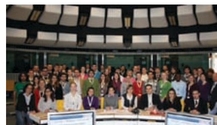
Students and speakers during Veterinary Students seminar on 8-9 March

The cooperation with veterinary students during the 2009 EU Veterinary Week has been very successful as 33 veterinary faculties had organised events across 14 Member States. Therefore it was decided to continue the collaboration with veterinary students in 2010 and a Veterinary Week Students seminar was organised in Brussels on 8 and 9 March to prepare for student actions for the EU Veterinary Week 2010. In total, 52 representatives attended the event including students from 41 faculties from 22 EU Member States, Croatia, FYROM and Norway. The participants discussed ideas and suggestions regarding the One Health roadshow, the EU Veterinary Week campaign and Vet 2011.