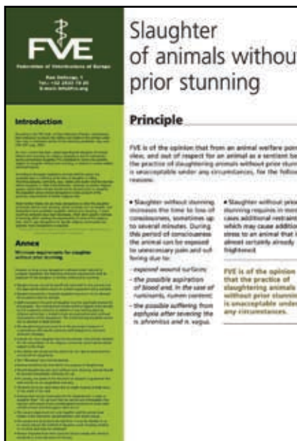
FVE poster on slaughter without stunning

To this end, a number of investigations, field studies, surveys and meetings were held, of which the results were presented and discussed in Istanbul. The final recommendations will be drafted during a meeting on 1-2 June. For a report on the main findings of veterinary interest, please go to http://www.fve.org/members/fve/temporary_docs/dialrel_2.pdf .